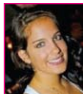
Michal Shany Film & TV Prod.