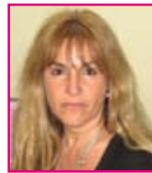
Lynne Kaplan Visual Arts