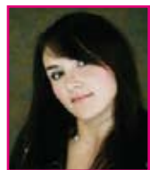
Stacey Taxin Photography